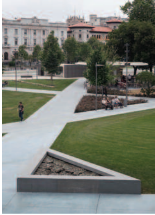
From the Underground, 2017. Stainless steel, pietra serena, mechanics, and water, 2 views of work at the Centro de Arte Botin, Santander.

of the mountain, the rocks, and the water zones under the ground. Toledo is a natural fortress because of the river that flows around the mountain.